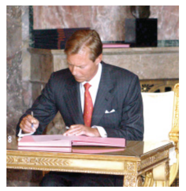
The Grand Duke signs the laws, decrees and treaties

The Grand Duke's representative character is based on the principle of the hereditary devolution of the