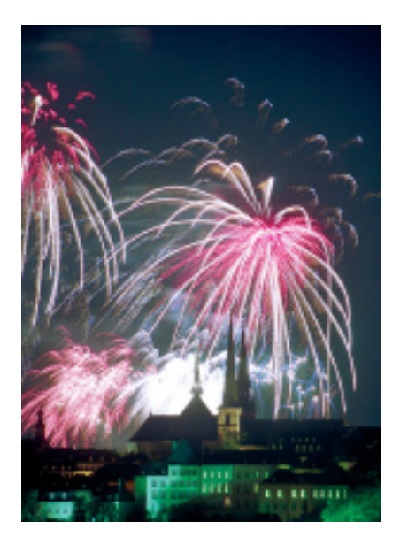
Thousands of persons gather each year in Luxembourg City to watch the traditional fireworks