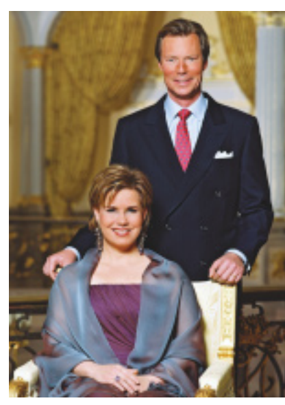
TRH the Grand Duke and the Grand Duchess

Declaration of HRH the Grand Duke on the accession to the throne on 7 October 2000