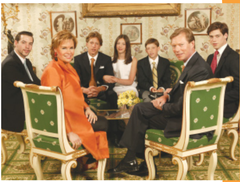
TRH the Grand Duke and the Grand Duchess with their five children

Since her husband's accession to the throne on 7 October 2000 she has borne the title of Grand Duchess of Luxembourg.