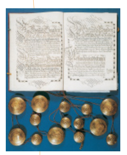
The 1783 family pact of the House of Nassau

Upon the German invasion on 10 May 1940, the Hereditary Grand Duke left Luxembourg with his family and the Government. In Québec, he took courses in law and political science at Laval University. In November 1942 he joined the British Army as a volunteer in the Irish Guards, where he gained the rank of lieutenant in 1943 and was promoted to officer in 1944. On 10 September 1944, he crossed the Luxembourg border with the American troops that liberated the Grand Duchy. He reached Luxembourg City in the afternoon, where he was greeted with wild enthusiasm. He then rejoined his unit on 13 September and continued the campaign with the Allies in Germany until the end of hostilities.