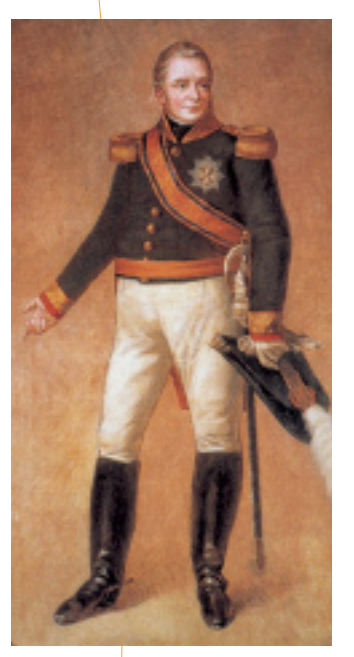
Grand Duke William I

Luxembourg gained true independence with the Treaty of London in 1839. This Treaty confirmed that the Grand Duchy was sovereign and independent, while simultaneously being joined in personal union with the Kingdom of the Netherlands and becoming a member of the German Confederation. Luxembourg was broken up after the Treaty of London, with the French-speaking part being given to the Kingdom of Belgium and the German-speaking part forming the independent Grand Duchy.