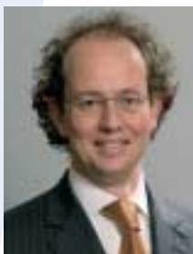
Jean-Louis SCHILTZ Minister for Development Cooperation and Humanitarian Assistance